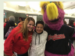
2018 Summer and Beyond Fair with Slider from the Cleveland Indians

This FREE event offers families and those who support children and youth with disabilities an opportunity to talk to agencies and organizations who offer academic, social-emotional, therapeutic and recreational supports year round in order to assist in developing independence, enhance growth and development, and prepare for post secondary options of students with disabilities. You can also pick up your free copy of the 2019 Summer and Beyond