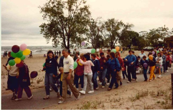
The Walkathon at Edgewater Park in the mid 80s