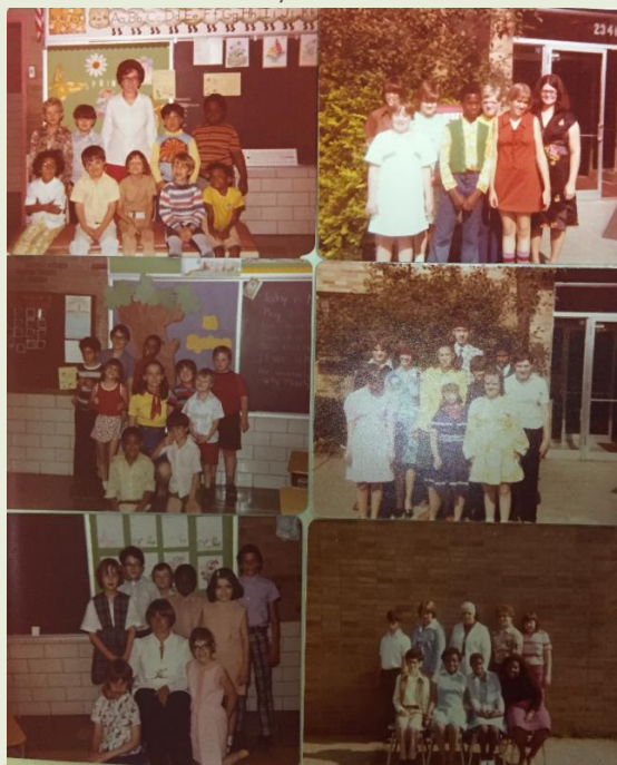
Students from St. Joseph Center in the 1970s